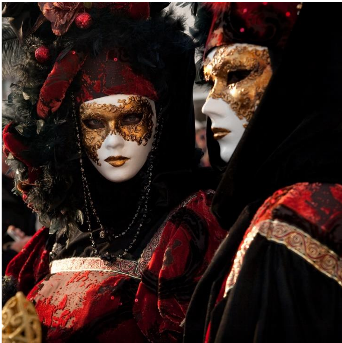
Fascinating Venice Carnival

During the tour you will visit a typical art atelier of glass , one of the oldest workshop in Venice, located in a nice Laguna context, professional and friendly at the same time.