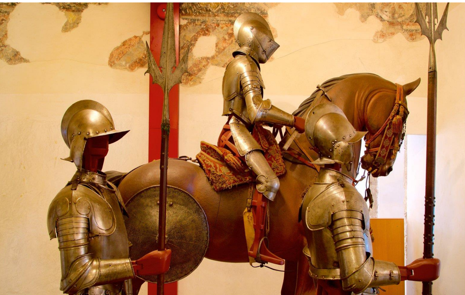
Castle Brescia, Medieval Weapons Museum

Why Italian food and recipes are so famous and object of desire? A fascinating Mystery indeed , waiting for you to be discovered...!