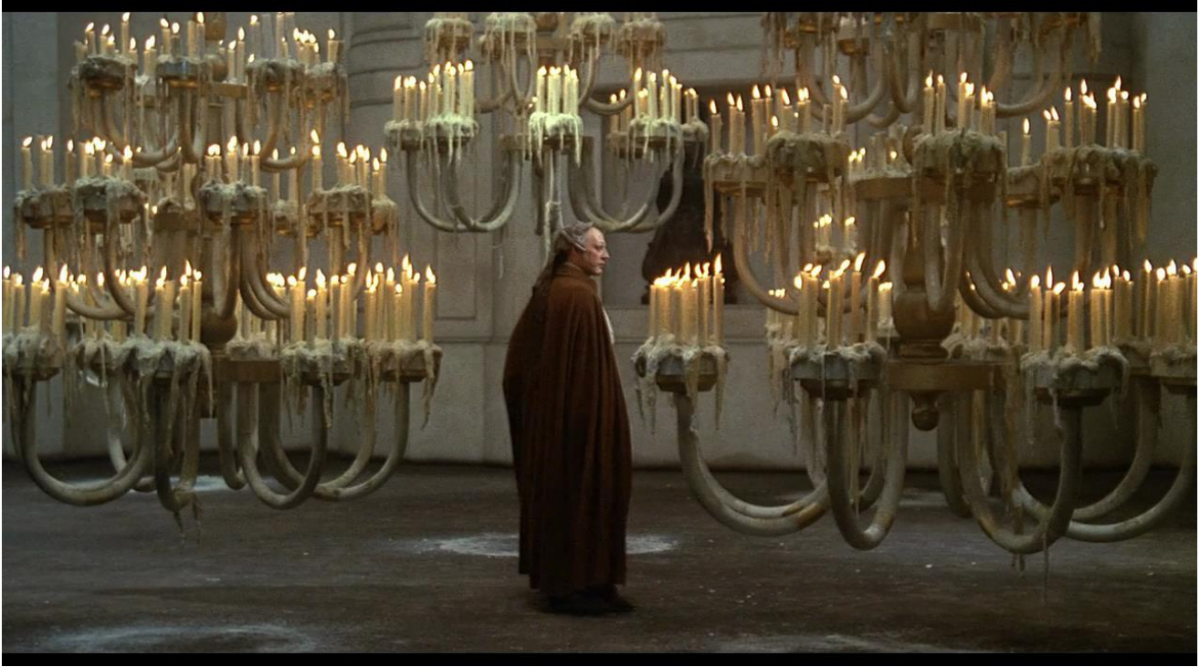
Giacomo Casanova character represented in a Federico Fellini movie

Starting from the Doge's Palace, whose prisons are famous for Casanova's mythical daring escape; the Ridotto, the gambling world so much beloved by the decadent and luxurious Venetian aristocracy, and then over to the Opera House Gran Teatro La Fenice; Campo San Maurizio, with the house of the erotic poet Giorgio Baffo, who introduced Casanova to the worldly pleasures; Campo San Samuele, where Casanova spent his childhood; Ca' Rezzonico, the once elegant residence of a noble family - today's Museum of XVIII century Venice.