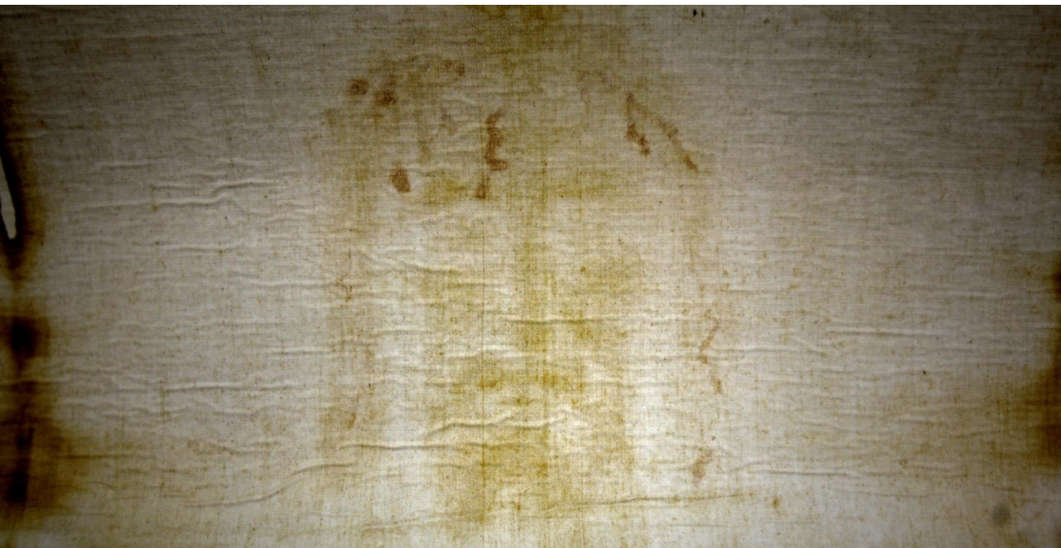
Sacra Sindone (Holy Shroud, detail Jesus face)