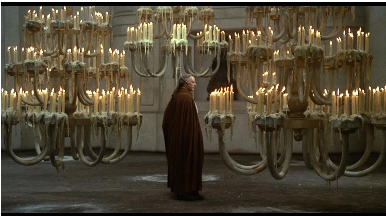
Giacomo Casanova character represented in a Federico Fellini movie

Starting from the Doge's Palace, whose prisons are famous for Casanova's mythical daring escape; the Ridotto, the gambling world so much beloved by the decadent and luxurious Venetian aristocracy, and then over to the Opera House Gran Teatro La Fenice; Campo San Maurizio, with the house of the erotic poet Giorgio Baffo, who introduced Casanova to the worldly pleasures; Campo San Samuele, where Casanova spent his childhood; Ca' Rezzonico, the once elegant residence of a noble family - today's Museum of XVIII century Venice.